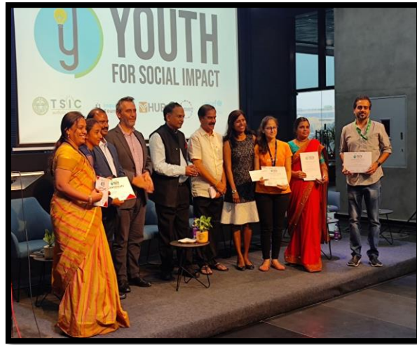
Pitching Competition at YFSI